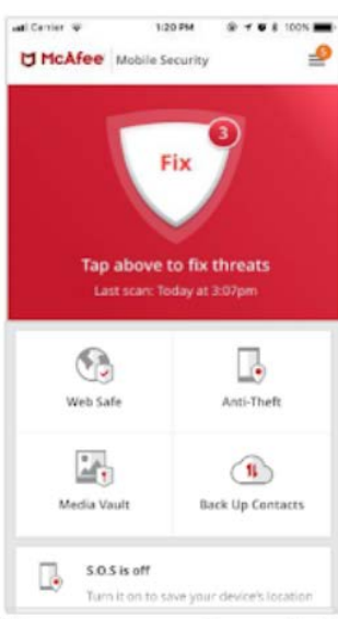
(New scan and results)